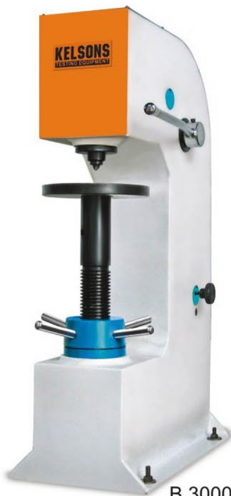
B 3000 (J)