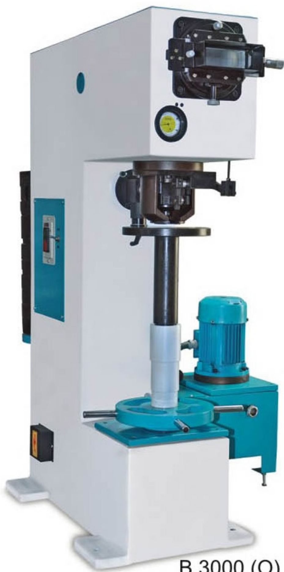
B 3000 (O)