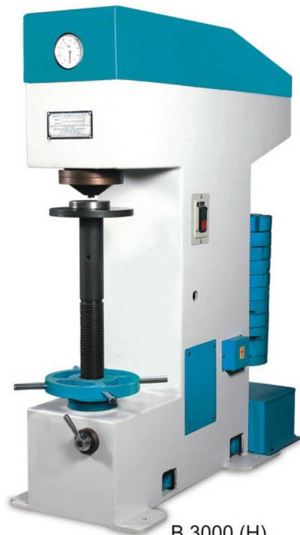
B 3000 (H)